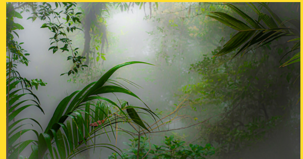
Cloud forest of Monteverde