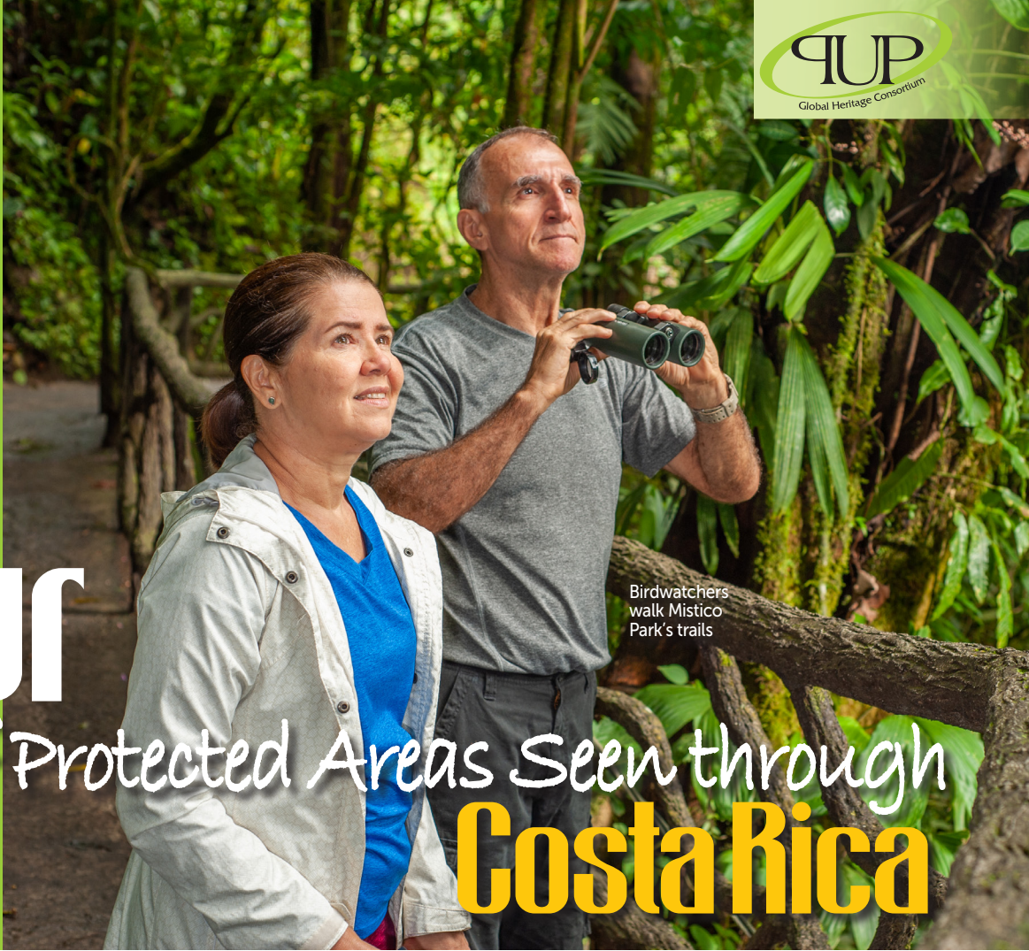
Birdwatchers walk Mistico Park's trails