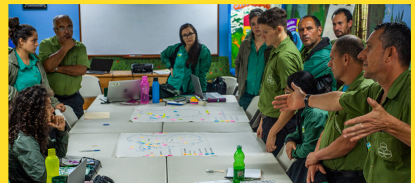
PUP condition-based zoning workshop in Monteverde