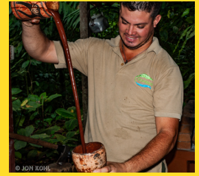
Tirimbina's famous chocolate tour