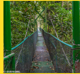
Tirimbina's suspension bridge, longest in Costa Rica