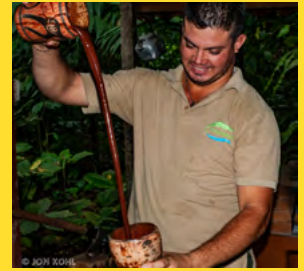
Tirimbina offers a variety of ecotourism activities