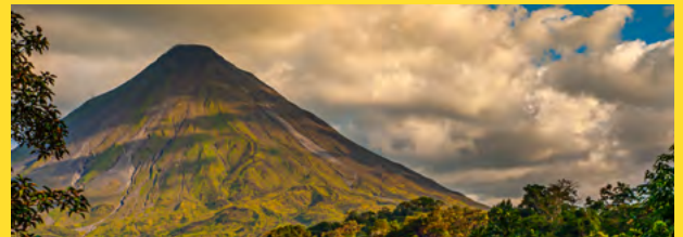
Arenal Volcano crowns Costa Rica's principal adventure tourism region in La Fortuna