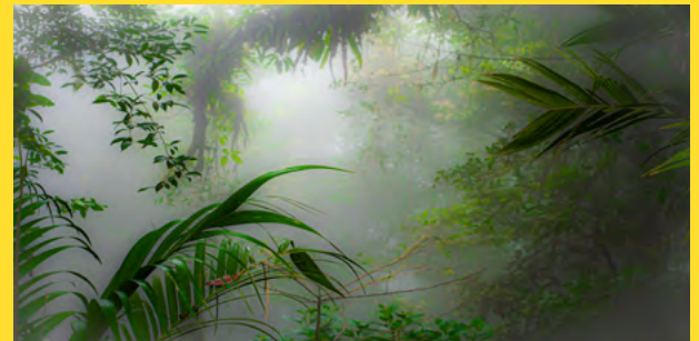
Typical view of the cloud forest in Monteverde